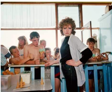
Martin Parr Ice cream girl, New Brighton, England, 1983-85

Alternative Text: A photograph of a pier and the sea.