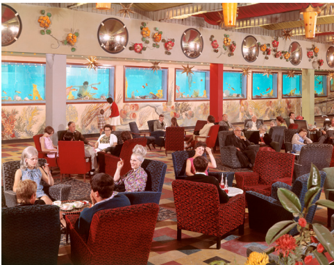
John Hinde Butlin's Bognor Regis, Lounge Adjoining Heated Indoor Pool.

Alternative Text: Photograph of a close up of an orange arcade game and a label reading 'insert coins'.