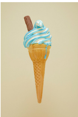
Luke Stephenson #97 Dawlish Warren, 2013

Alternative Text: A photograph of a white whippy ice cream in a cone on a beige background, with a red streak of syrup dripping down the cone and a flake sticking out of it.