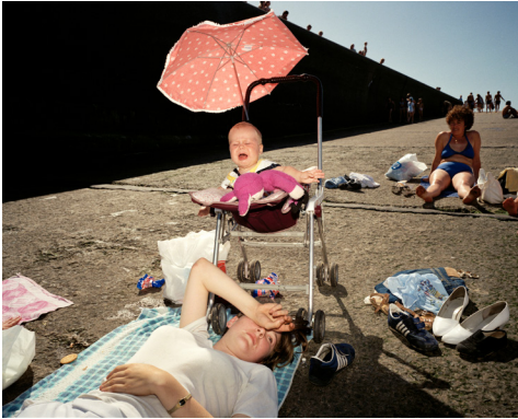
Martin Parr Crying baby, New Brighton, England, 1983-85

Alternative Text: A photograph of a baby crying in a push-chair and a person sunbathing on the ground next to the highchair.