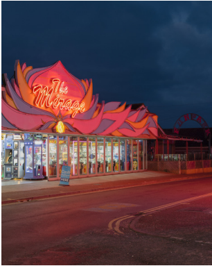
Rob Ball Mirage, Hemsby, 2021 Courtesy of the artist and The Photographers' Gallery

Alternative Text: Photograph of an arcade building with a sign in neon orange lights.