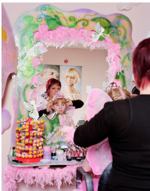
Anna Fox Hair and Make Up Shop, 2010

Alternative Text: A photograph of a person in a pink fairy outfit, smoking a cigarette and looking at their phone.