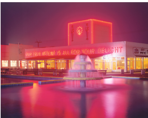
John Hinde Butlinland Skegness, Night Scene

Alternative Text: A photograph of a group of people sat in chairs around tables, with a row of large fish tanks in the background.