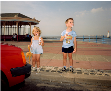
Martin Parr Ice cream kids, New Brighton, England, 1983-85

Alternative Text: A photograph of a baby crying in a push-chair and a person sunbathing on the ground next to the highchair.