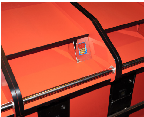
Rob Ball Coral Island, Blackpool, 2022

Alternative Text: Photograph of an arcade building with a sign in neon orange lights.