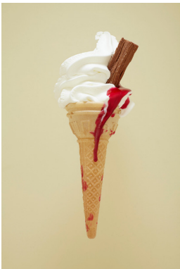
Luke Stephenson #56 Crosby, 2013

Alternative Text: A photograph of two children eating ice cream, standing beside a red car.